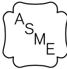
New ASME Product Certification Mark

In order to streamline our multiple marking processes and more effectively manage our numerous global relationships, ASME is pleased to announce the introduction of a new single product certification mark: